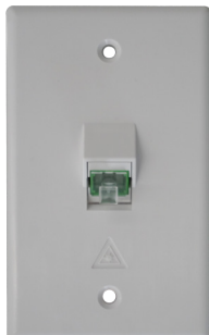
Angled Wall Plate