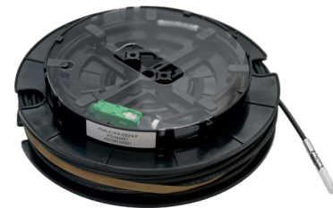
FLEXdrop Deploy Reel