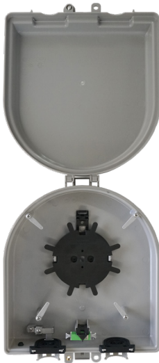
Deploy Reel TAP