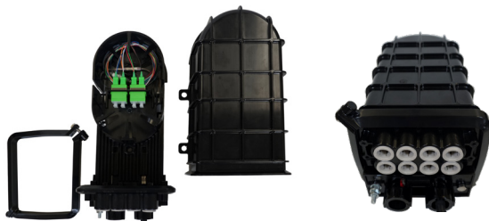
Patch and Splice