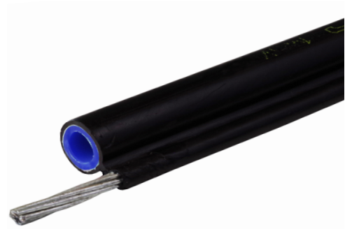
7 strands of 1.6 mm galvanized steel (twisted)

FieldShield Aerial 10/8 mm Microduct is a 10 mm diameter, self-supporting (figure-8 style) microduct intended to deploy fiber the same way an aerial drop is installed. Designed to comply with North American storm and ice loading standards, the strength member makes FieldShield Aerial 10/8 mm Microduct the solution for spanning up to 500 feet (152.40 m). The FieldShield Aerial 10/8 mm Microduct supports FieldShield Pushable Optical Fiber up to 3 mm in diameter.